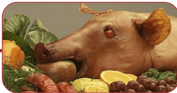
Displayed with apple in mouth and cherries in the eyes.

Includes Homemade Pork Gravy and our signature BBQ Sauce and your choice of stuffing, slow cooked inside your pig!