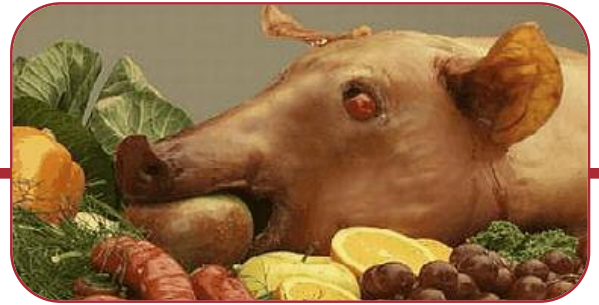
Displayed with apple in mouth and cherries in the eyes.

2135 Bustard Road, Suite 8, Lansdale PA 19446 610-584-6212 • www.allaboutcatering.com